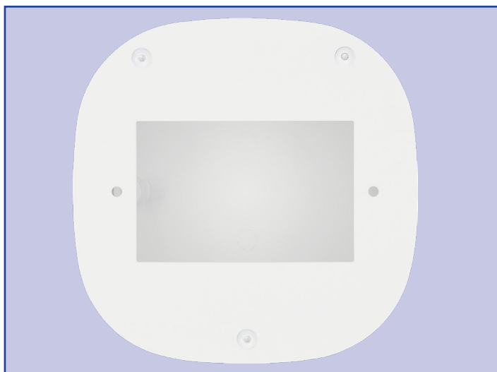
Faceplate compatible with all standard domestic power points (power point not included)

These cost effective kits will futureproof any home while giving you the convenience of immediate access to a domestic power outlet. During the wiring phase, a dedicated circuit is created from the distribution board to the EV Ready Kit, this is then terminated as a domestic socket outlet. When you require an EV charging station it is quick and easy for an electrician to swap out the adaptor plate and socket outlet for a Wallbox Pulsar or Pulsar Plus unit.